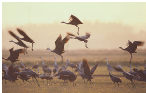
Figure 1 | Ambiguous signal. Are flock-mates taking flight in response to a predator?

As for the generality of this type of anti-predatory communication, it is certainly true that birds taking flight (Fig. 1) or mammals taking